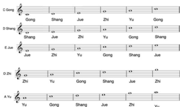
Example 1. Pentatonic in C Gong system

The pentatonic scale is often used in folk music and ancient Chinese music. Five notes consist of the pentatonic mode, which is arranged in the perfect 5th interval. Assuming C as the starting note, the arrangement of the fifth interval is C-G-D-A-E. Therefore, sorting them by pitch is C-D-E-G-A. These five notes are Gong, Shang, Jue, Zhi and Yu. Using the pentatonic scale, each tone can be the tonic (see Example 1), thus the pitch position of the tonic must be indicated in each mode. For example, when C as the tonic, it is called C Gong mode and when D as the tonic in C. In the pentatonic scale, there are no sharp intervals like the minor second, and the major third (minor sixth) is formed between the Gong and Jue, hence it is particularly pleasant to listen to.