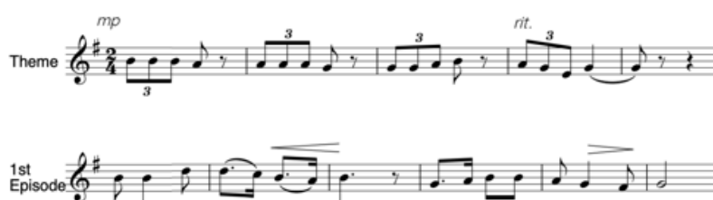
Example 2. Dock Workers’ score in Storm Over the Yangtze River

According to the score, the music is centered around G-B-D, a pentatonic scale, and incorporates European major modes principles and development techniques. As a result, Nie Er’s music has a strong national flavor as well as a contemporary feel. Shanghai Pier’s work song is the source of this music. To create the image of the coolie, Nie Er used a variety of musical expression techniques, such as syncopation, dotted notes and rests.